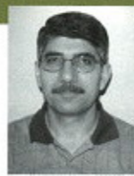
4. Al Sorisho Concord, CA